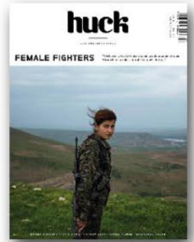
Huck Feb/Mar 2016

How to use: Use this Knowledge Organiser to compare and contrast these magazines. Highlight the similarities and differences.