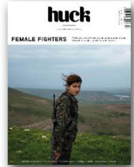
Huck Feb/Mar 2016

How to use: Use this Knowledge Organiser to compare and contrast these magazines. Highlight the similarities and differences.